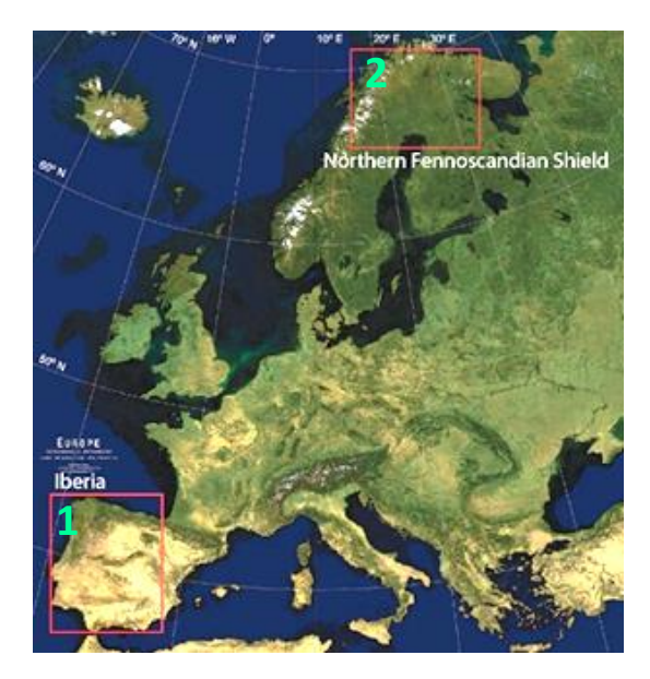
Figure 2. NEXT brings a focus on distinct ore deposit types in: (1) the Iberian Peninsula and (2) the Northern Fennoscandian Shield